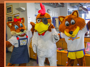
FOXY, ROXY & DR CLUCK