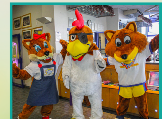
FOXY, ROXY & DR CLUCK