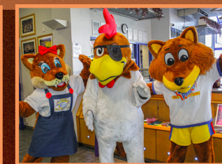
FOXY, ROXY & DR CLUCK